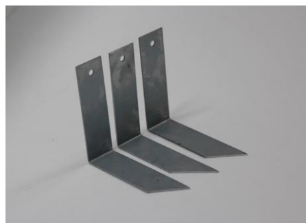
3 brackets supplied for every 1220mm barrier