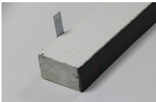
Rainscreen Fast Fix Cavity Barrier

An effective solution for ventilated rainscreen cavities available in a range of sizes allowing for a continuous air gap of up to 25mm and up to 40mm. The Fast Fix cavity barrier combines high-density rock fibre with intumescent coating on both sides and an intumescent strip which, in the event of a fire will seal the ventilation gap. Supplied in 1220mm lengths with 3 fixing brackets per length.