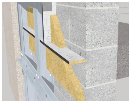
Suitable for both horizontal and vertical fitting