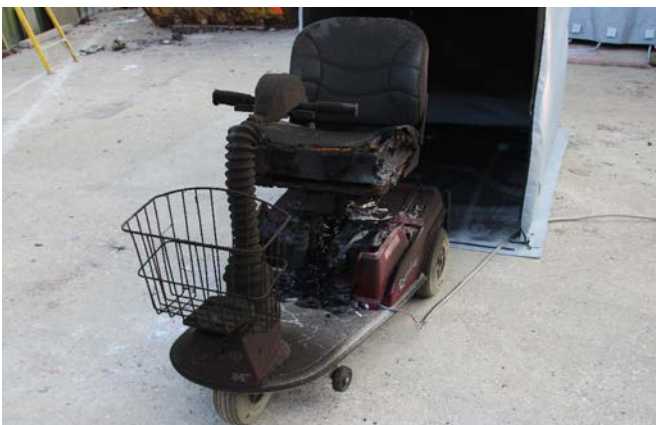
Damage to mobility scooter following Envirograf® fire test