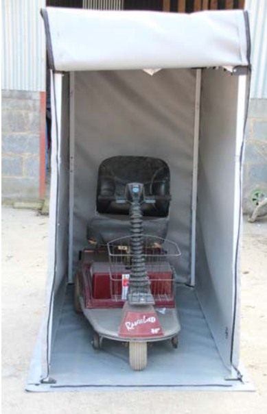
Mobility scooter parked in new design cover

We have now designed and manufactured a new cover with these additions. During a further fire test, it was shown that the new design does not allow smoke to be emitted and that the damage to the scooter itself was minimal: only the battery and seat caught fire before the lack of oxygen caused it to extinguish itself. We also opened the front flap of the cover to see if allowing oxygen back in would cause it to reignite, but the fire did not relight.