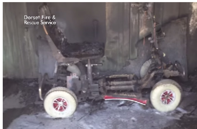
Damage to mobility scooter following Dorset Fire & Rescue fire test, showing considerable damage to scooter