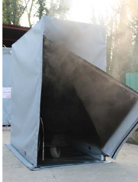
Front flap being opened to allow oxygen to enter the cover - note that fire did not reignite