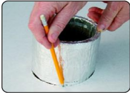
STEP 1: mark the outline for the Firoblok sleeve on the substrate

Firoblok sleeve can be easily fitted from above or below the ceiling