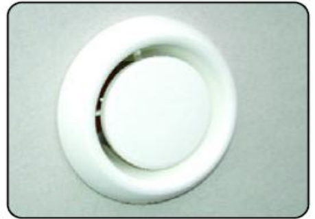
STEP 6: the finished vent with fire protection – a neatly finished job!