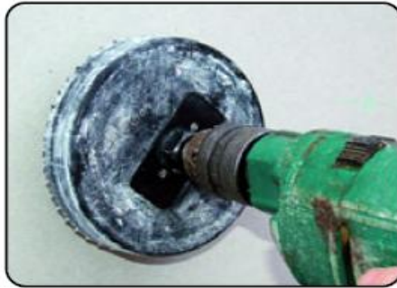
STEP 2: cut out the hole with a powered hole saw or see step 3