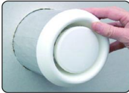
STEP 5: push the assembly back into the substrate until flush