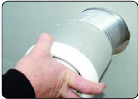
STEP 4: fit the Firoblok sleeve over the vent and fit to the ducting